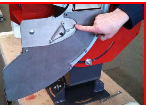
Step 4 – Refit the Outer Guard to the side of the machine.