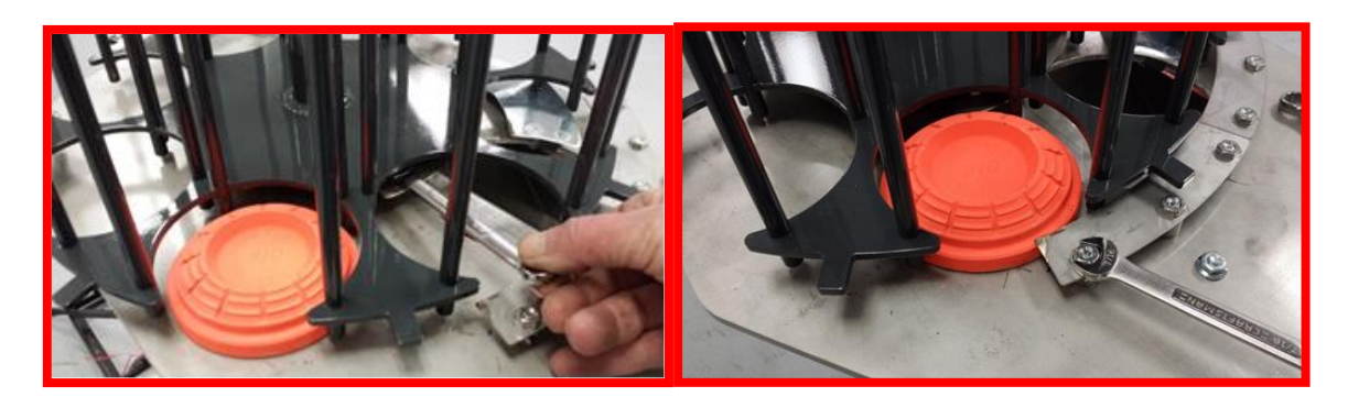
Step 4 – Put some clay's in the carousel, but do not fill just yet, as this will make it easier to adjust the elevation and tilt of the machine. It should be pointed out that if the machine is tilted forward, it will throw a low target along the ground. Tilting all the way back will allow the machine to throw a vertical teal target.

Step 3 – Your machine has been set at the factory for White Flyer clays. Clay sizes may vary between manufactures. You may need to check the height / clearance of the knife-edges by placing a clay in the carousel. Rotate the carousel so that the clay starts to pass underneath the inner and outer knife separator blades. The clay must pass freely under the knife separator blades without binding but with the minimum of clearance. Adjust if necessary with 7/16" open ended wrench. The height on both the inner and outer knife edge will need to be adjusted. Please note, the photos below show knife edges being set with a Standard target instead of a Rabbit target, but the same principle applies.