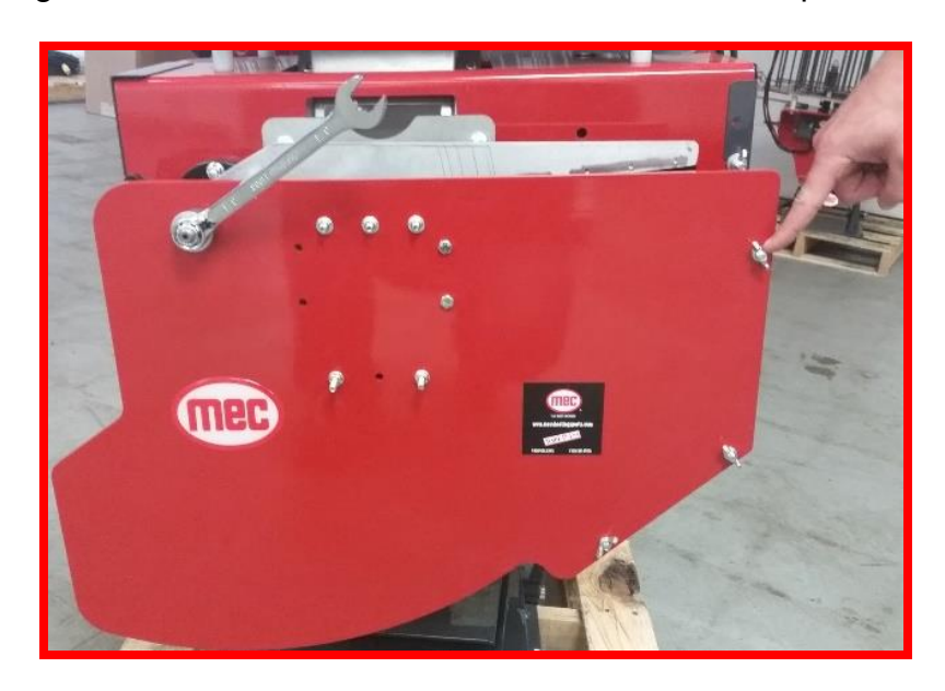
Step 2 – The Rabbit Plate is attached to the back side of the Throwing Plate and will need to be removed using a 7/16" wrench. There are four Allen bolts, attaching the Rabbit Plate to the Throwing Plate.

Step 1 – Remove the outer guard by un-doing the \frac{3}{4} " locknut on the front and the three \frac{1}{2} wingnuts on the rear of the machine as shown in the photo below.