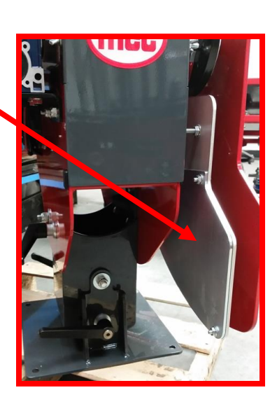
Step 3 – With the Rabbit Plate removed, it now needs to be attached to the front side of the Throwing Plate as shown in the photo below. Simply hold the plate straight to the throwing plate and push the front rail to the full open position. Slide plate on and release the front. Replace the Allen bolts to securely attach the rabbit plate to the throwing plate.