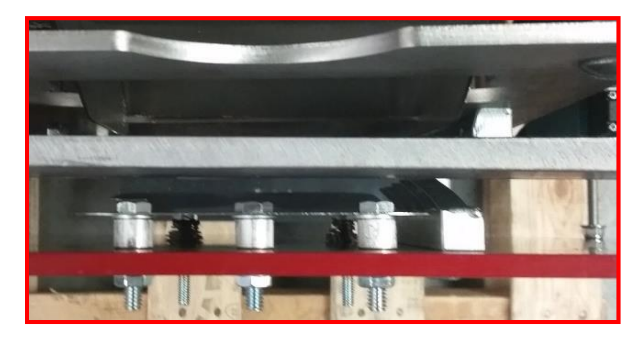
Step 8 – Fill the machine with targets and set the tilt and elevation before reconnecting the battery.

Step 9 – Check that the ON/OFF/DISARM toggle switch on the grey control box in the OFF position. Connect the terminals from the wire harness to the battery. A fully charged, good quality, deep cycle marine battery is recommended. It is imperative that the Red Wire goes to positive (+) and Black Wire goes to negative (-) on the battery. Never hammer the terminals onto the post of the battery and do not over tighten the terminals.